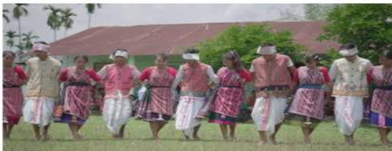
Karbi dance group