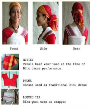
Gathigi (Traditional headscarf)