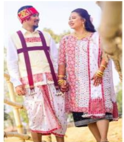
A Newly Married Karbi Couple