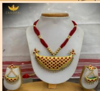
Junbiri (Traditional Motif) Madoli (Traditional Motif)