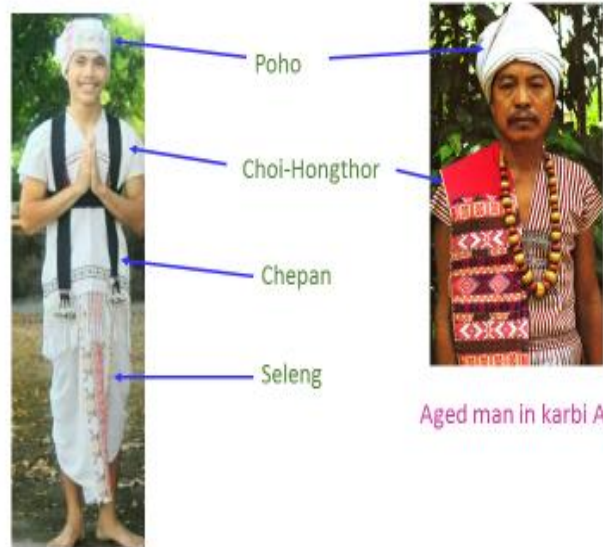
Young man in Karbi Attire