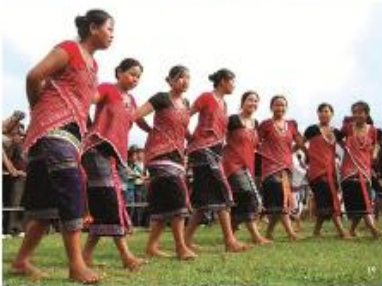
Karbi girls wearing pekok and dancing traditional dance

Rongker: Thanksgiving to God , it is Celebrated on 5 February in year.