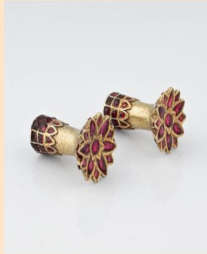
Thuria (Traditional Earring)