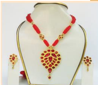
Dugdugi (Traditional motif)