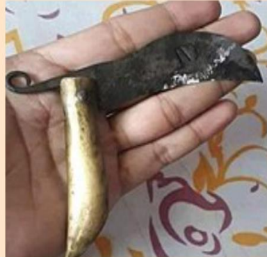
Dabua Katari (Traditional knife)